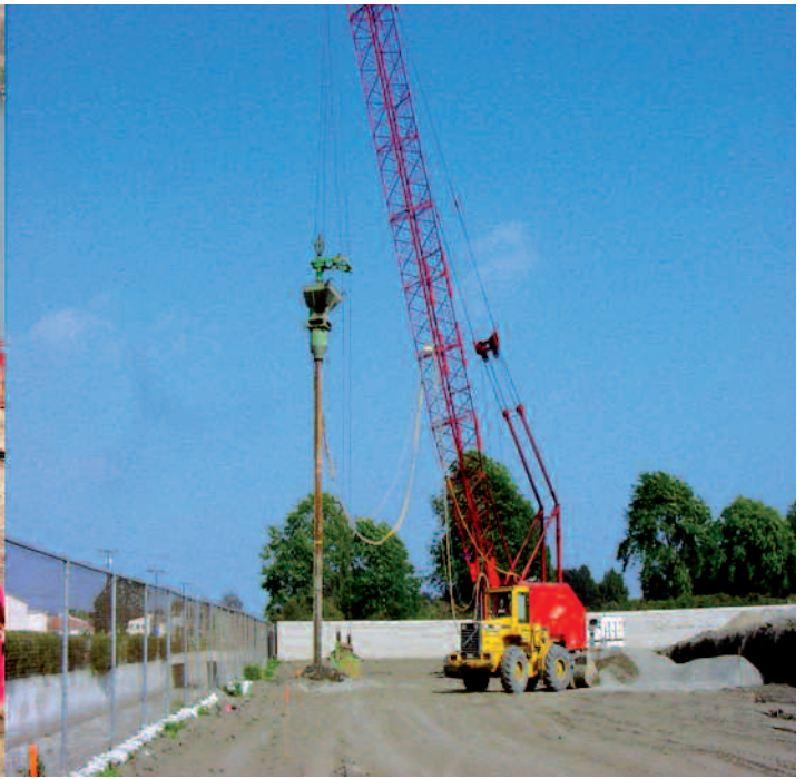
Bottom-Feed Stone Columns